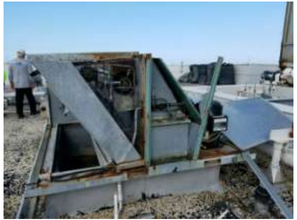
15 Ton unit on roof for hallway air conditioning destroyed.

9/18/2017 - This file will no longer be updated. The Office will be sending updates directly to owners.