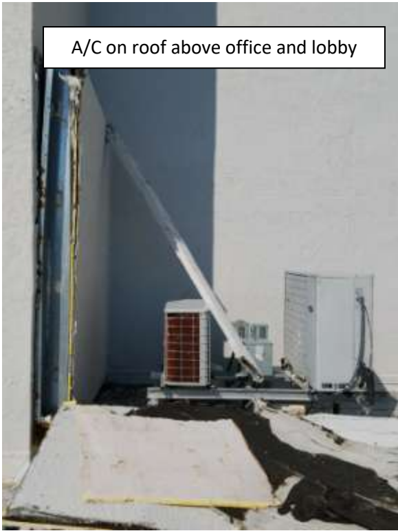
A/C on roof above office and lobby